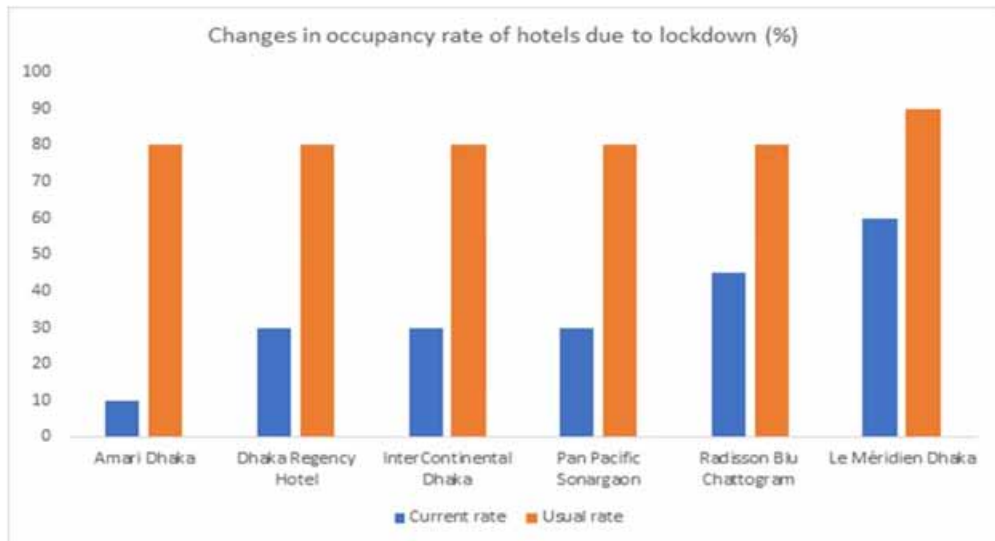
Figure 2. COVID-19 impact on the occupancy rate of luxury hotels